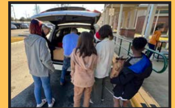
Sock and food donation drive