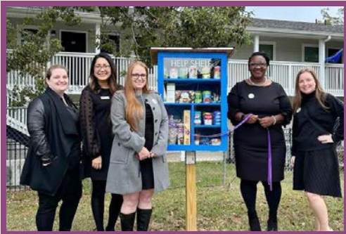
Free Library donated by Junior League