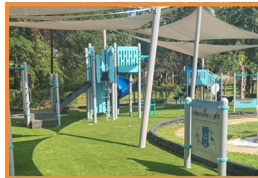
Bag for HOPE Playground updated during renovation with shades