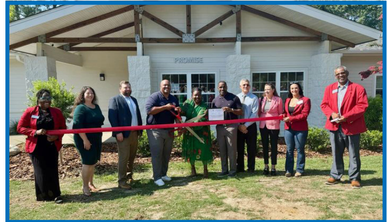
Ribbon cutting of HOPE after renovations with Senator Corey Simon and board members

I extend a heartfelt invitation to you - whether you're a long-time supporter or just learning about us - to come visit HOPE and see these transformations firsthand. We would also welcome the opportunity to speak at your