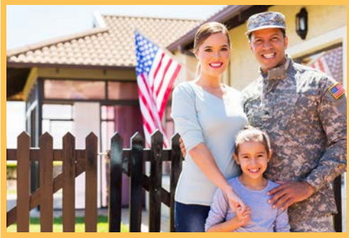
Supportive Services for Veterans