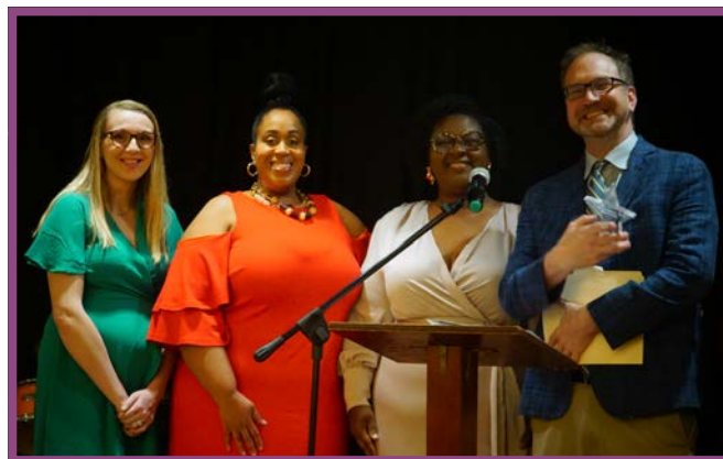
Tallahassee Democrat honored at our annual event for coverage of homelessness and affordable housing